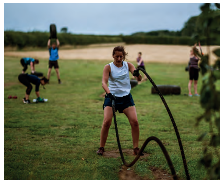
OUTDOOR GROUP EXERCISE CLASSES, YOGA & PERSONAL TRAINING