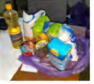
Smart phones for pupils A typical food parcel