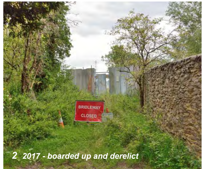
2 2017 - boarded up and derelict