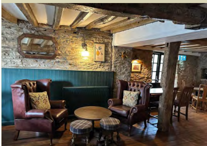
The North Street bar