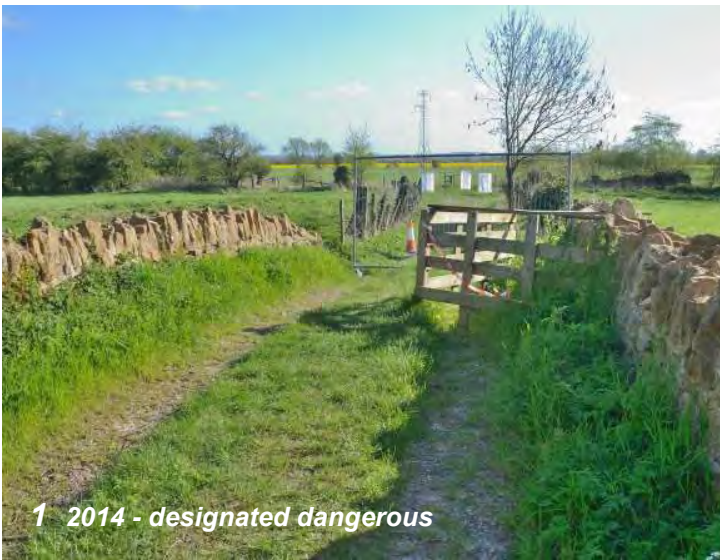
1 2014 - designated dangerous