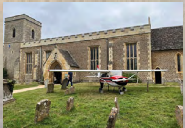
A Cessna 152 awaiting take off In aid of MAF - Full story in future issues