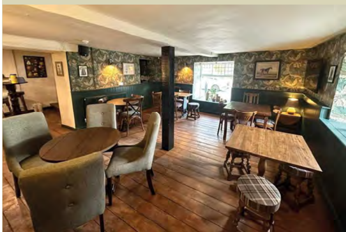
The Packhorse Lane bar