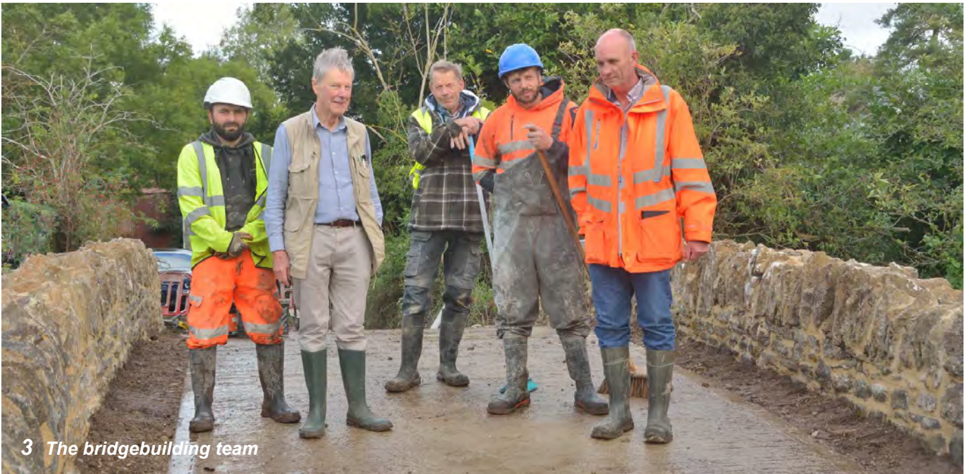
3 The bridgebuilding team