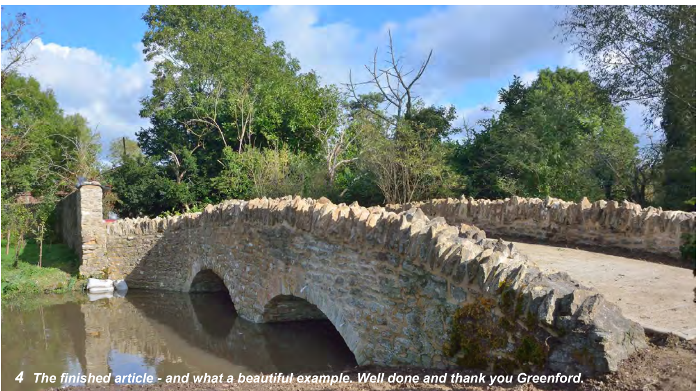
4 The finished article - and what a beautiful example. Well done and thank you Greenford.