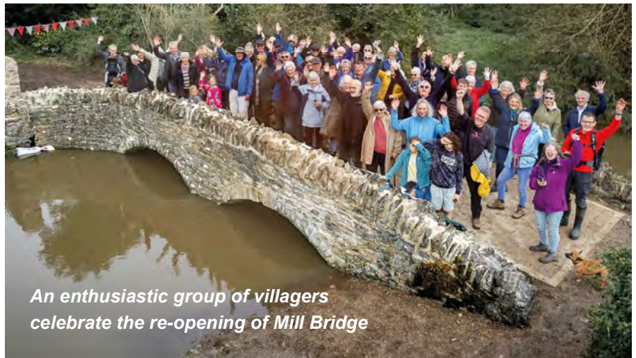
An enthusiastic group of villagers celebrate the re-opening of Mill Bridge

After a small section of the crown of the bridge had collapsed, it was deemed necessary to close it on the grounds of safety in July 2013. Work started on the repairs in August 2023, beginning with clearance of the vegetation which had grown extensively in the ten years since its closure. The arch, piers and parapets were re-built, with some re-shaping of the water channels beneath to reduce erosion. A stainless-steel reinforced concrete cap was laid over the crown to spread loads more evenly across the bridge and reduce the risk of a future collapse of the kind that happened ten years ago.