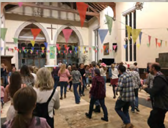
Line dancing in aid of MML