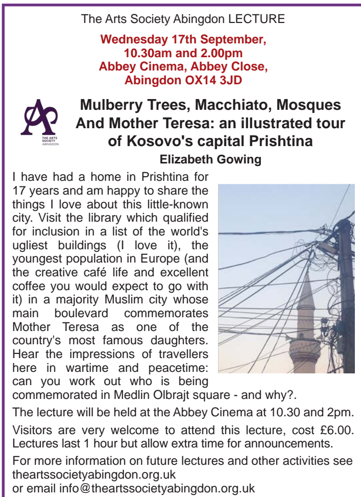
Image: Photo of Prishtina 'mosque and wire'